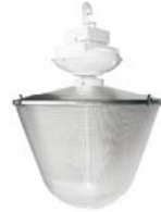
"Gum drop" Style (150W-250W)