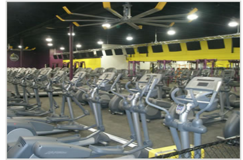
Featured Project: Major Fitness Facilities